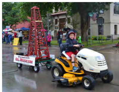
It was difficult to keep dry on parade day.