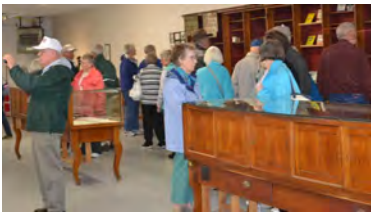
The Southport Senior Citizens group (from Elmira) toured in late September