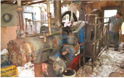
Checking out an old engine that powered a bandwheel power on the Vosburg Lease