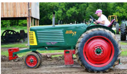
Neither men nor women drivers were intimidated by the weather at the tractor pull