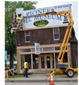
Installation of the new Main Street sign

2015 - Parade Day may have been a wash-out, but it was still a busy year for the museum