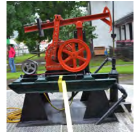
One of the pieces of oil field equipment on display on parade day