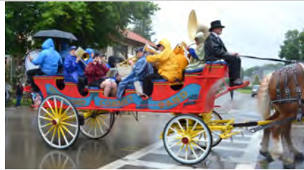
Not even a downpour could stop the Rushford Cornet Band